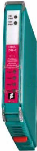
Figure 2—Power Hub Diagnostics Module

Mobile Advanced Diagnostic Module – The Mobile Advanced Diagnostic Module DM-AM (see Figure 3 on the next page) is a USB-powered universal tool to analyze the physical layer parameters of a fieldbus segment. The module includes an integrated USB 2.0 interface for convenience and portability in the field. It can be connected anywhere on the fieldbus network. As a part of the Pepperl+Fuchs FieldConnex Expert Diagnostic Manager software package, it provides basic analysis of signal and segment parameters (e.g. measurement of specific system and node physical layer values, increasing noise or jitter levels, and unbalance detection). It also provides basic analysis of advanced functions such as alarming, trending, report generation and oscilloscope function. The