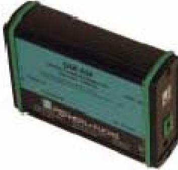
Figure 3—Mobile Advanced Diagnostics Module

integrated oscilloscope function enables visualization of the communication on a segment. Monitoring of relevant physical layer parameters can allow proactive detection of degradations before the segment communication fails.